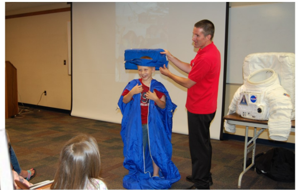
NASA: The Journey to Mars and Beyond visits the library.

E-books: 191,805 Downloadable Videos: 3,751 Downloadable Audio: 52,307 Databases: 81