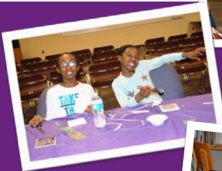
Children enjoy the relaxing benefits of coloring during a Get Crafty! Program.